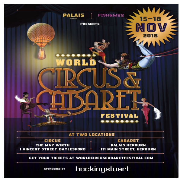
Term 4 2018 No. 33 Friday, 16th November, 2018