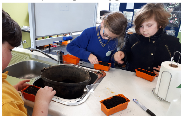
Sowing seeds in garden class!

Term 2 2018 No. 23 Friday, 17 th August, 2018