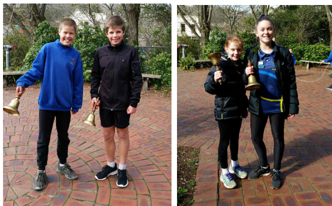
Back to manual bell ringing during the power outage!