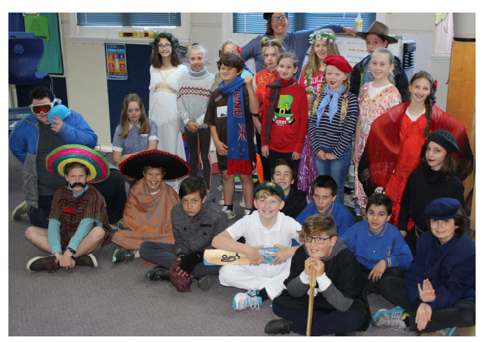
Current Focus (Listening)