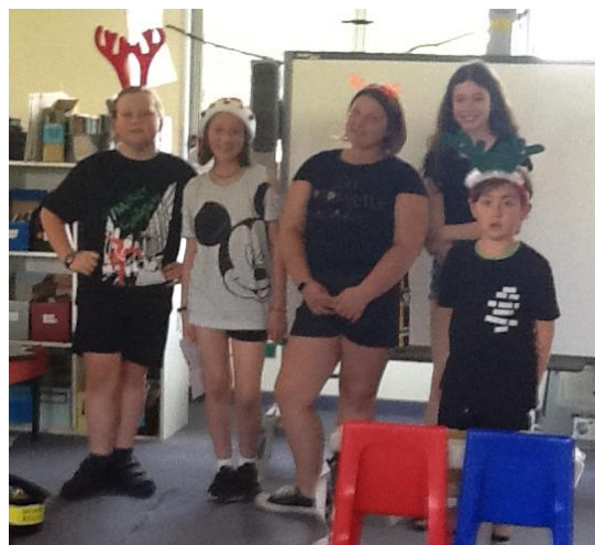
The Stars of Our Show

The students have put together a video of the performance which is a compilation of all the performances.