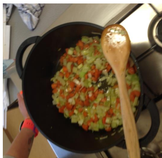
Cooking the vegetables... Yum

We have attached our wonderful Minestrone Soup recipe so that you can replicate it at home. It was really tasty and we enjoyed the experience immensely.