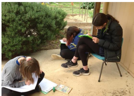
Starting our Big Write.

Hats are to be worn at all times in the playground during Terms 1 & 4