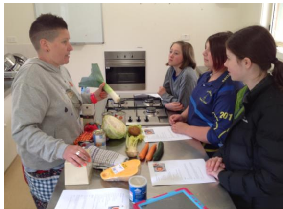
Talking about the vegies that will be used to make our Minestrone