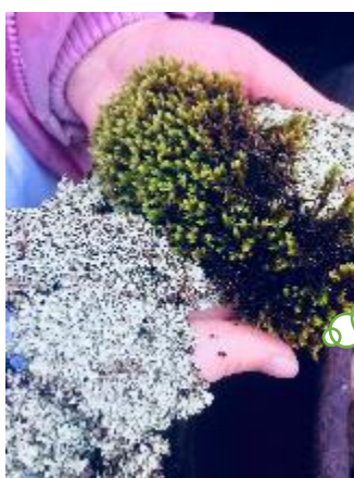
Moss and Lichen