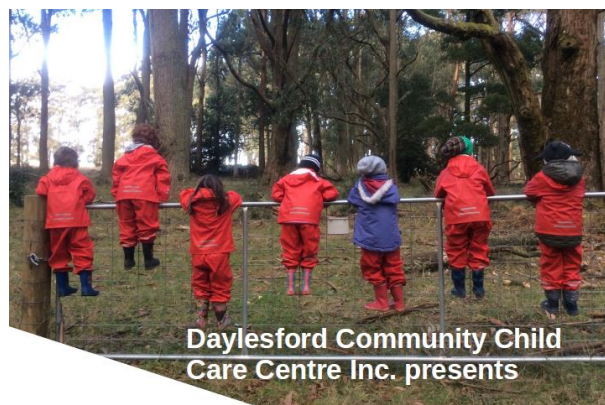
Daylesford Community Child Care Centre Inc. presents