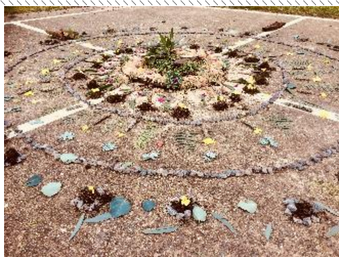
Our Mandala .... Made with materials from the Earth to link Visual Arts with our Earth Science Unit.

We have had a busy week of learning. The children have finished their earth science presentations which were insightful and showed solid understandings about the world that we live in.