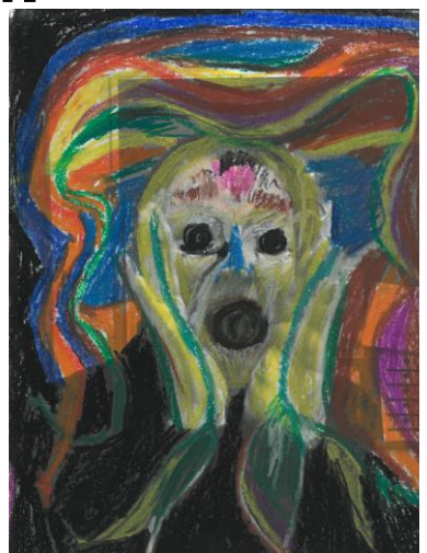
Taking our inspiration from "The Scream" by Edvard Munch