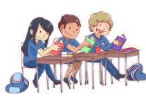
The school earns Scholastic Rewards.