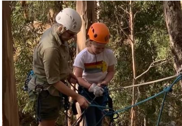
Term 2 2023 No.6 Thursday 27th April