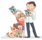
Families order from Book Club.

Every purchase you make earns your child's school 15% of your order value in Scholastic Rewards that can be used to purchase valuable educational resources that benefit your child.