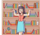
The school redeems Scholastic Rewards for additional resources