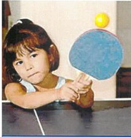
Table Tennis Fun and Fitness for Kids under 12 Coaching Program