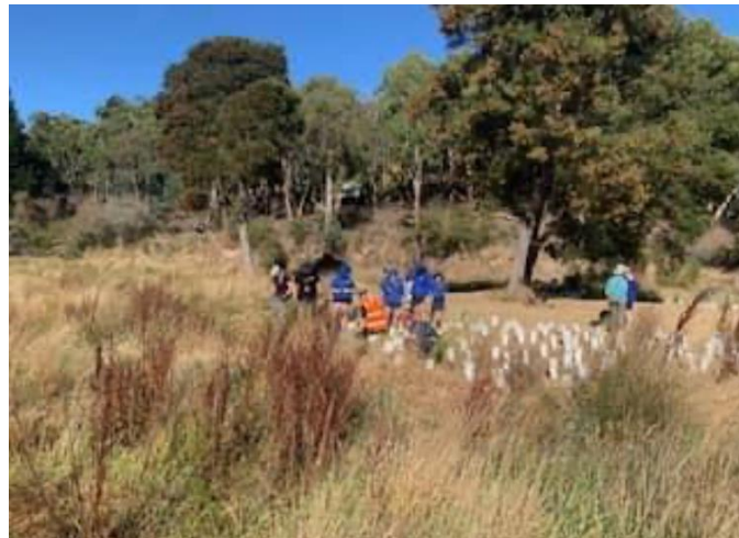
The Grove of Gratitude